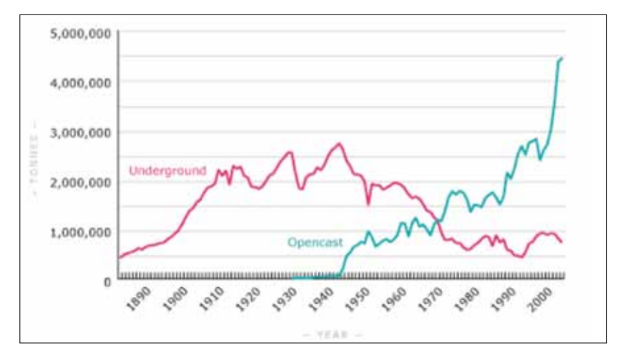
Figure 19.2: Open versus underground mining<sup>15</sup>

21. There have been significant changes in the way in which coal is mined in New Zealand. Up to the 1940s coal was mined almost exclusively using underground methods. Since the Second World War open cast mining has been in the ascendancy (see Figure 19.2). By the 2000s only about 20% of annual coal production came from underground mines.